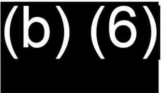
Area Supervisor Mobile II Field Office